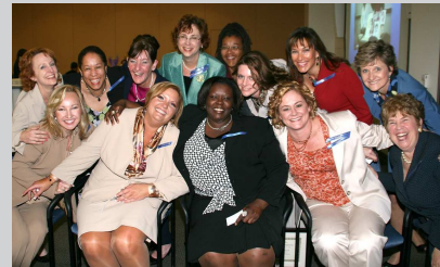
2008 Graduates & Instructors

It is a gathering of your close friends, family, and colleagues, who want to give a gift of meaning and significance that will change a woman's life. Part of the Circle of Hope is a financial gift. Your team's $2,500 donation sponsors a woman through our year-long program.